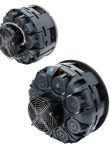
Torque Range from 1,9 Nm to 1.760 Nm