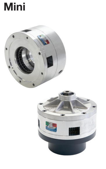
Torque Range from 17 Nm to 275 Nm